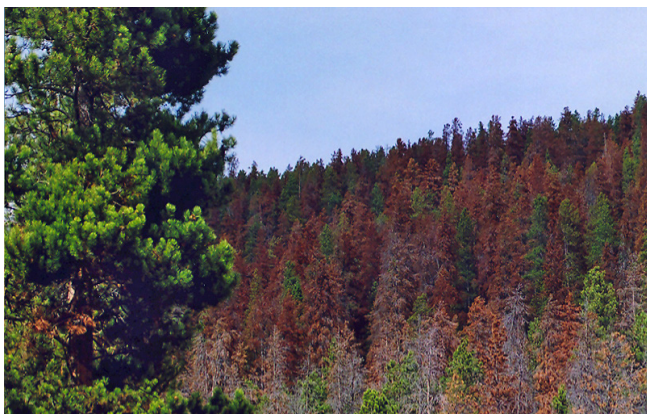
Millions of trees have already been killed by the mountain pine beetle and millions more are vulnerable.

Forest scientists, foresters and land managers are very concerned that insects like mountain pine beetle can and will do serious damage. Millions of trees are already affected and millions more are vulnerable, something to consider when we have a milder than normal winter.