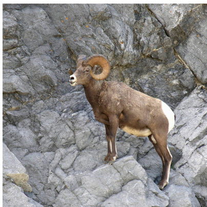
Rocky Mountain big horn sheep