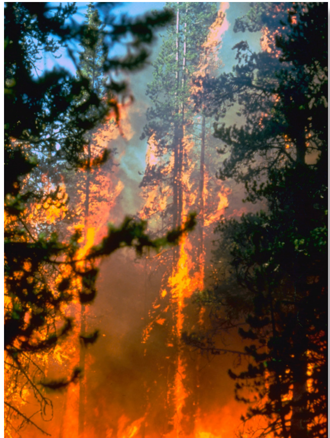
Climate change may increase how often and how severely forest fires will occur.